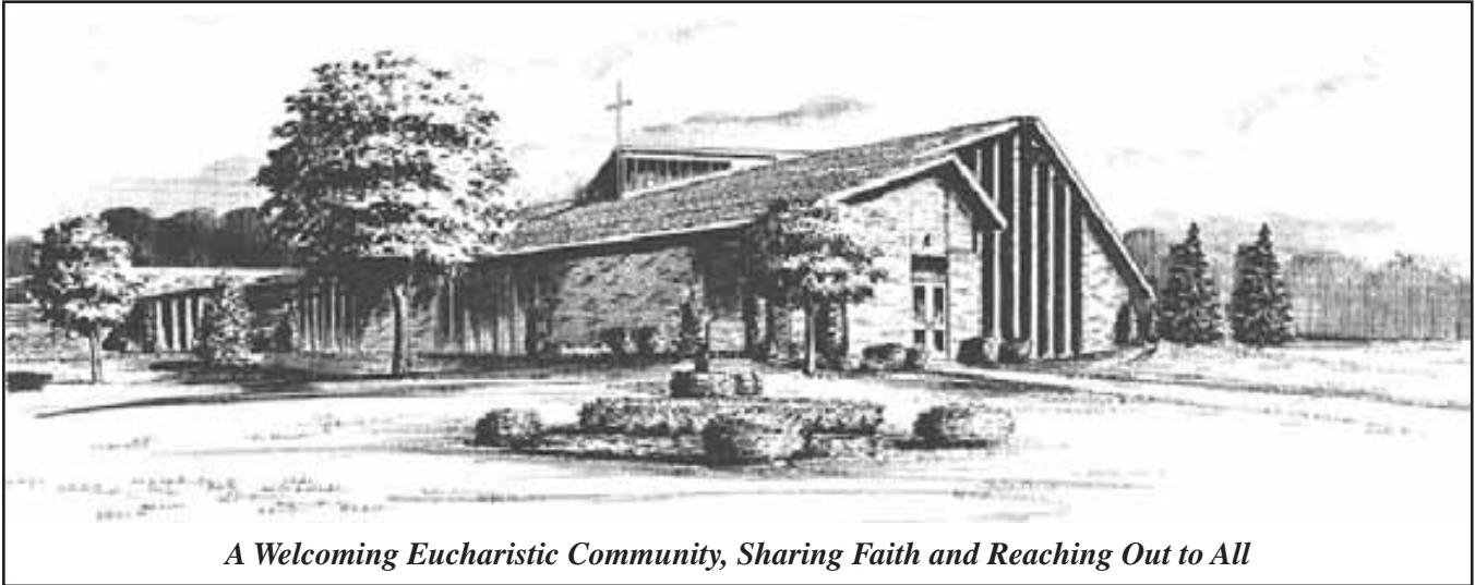
A Welcoming Eucharistic Community, Sharing Faith and Reaching Out to All

511 CHEAPSIDE ST., LONDON, ONTARIO N5Y 3X5 PHONE 519-433-6689 FAX 519-433-2301 E-MAIL: stmichlon@dol.ca www.stmichaels.dioceseoflondon.ca